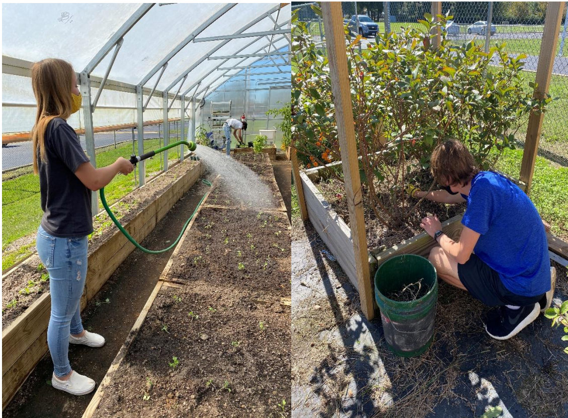
Students tending to raised beds in High Tunnel with the CHHS AgriProject team.