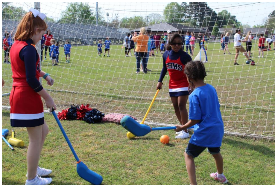
Colonial Heights Public Schools hosted its fifth annual Little Feet Meet on May 6 at Colonial Heights Middle School. Created by Special Olympics of Virginia, the Little Feet Meet is designed to provide fun athletic activities to young children with intellectual disabilities.